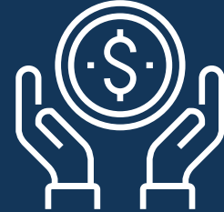
Proactive Cost Containment Strategies