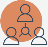
Captive Facilities & Management