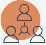
Captive Facilities & Management