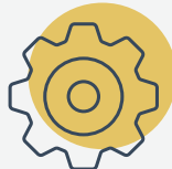
Program Development & Management