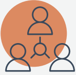
Captive Facilities & Management