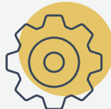
Program Development & Management